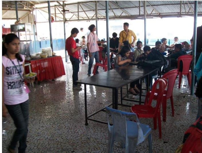
Any other facilities