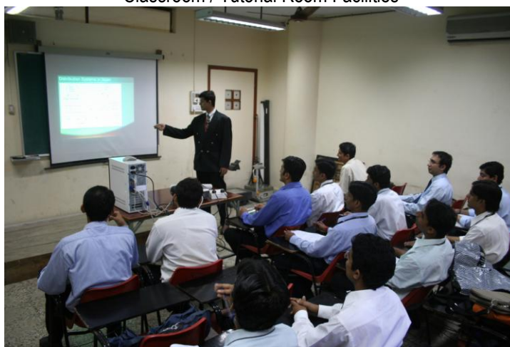
Classroom / Tutorial Room Facilities