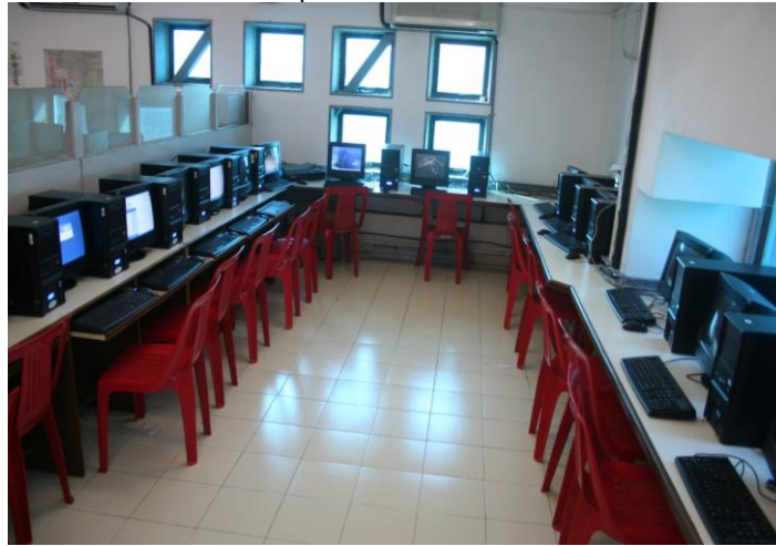
Computer Centre facilities